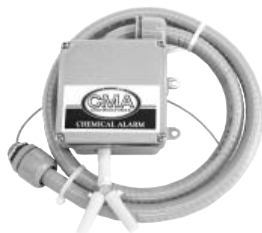
Low Chemical Alarm