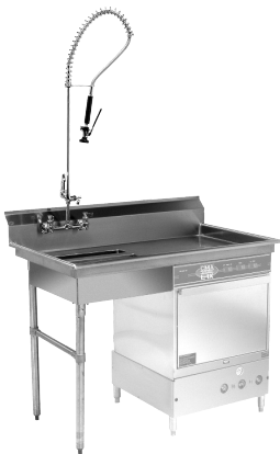
48" Undercounter dishtable with Pre-Rinse