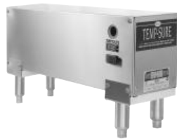
CMA Temp-Sure (Self contained 12kW heater)