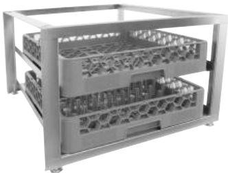
Universal Pedestal (24"W X 25-3/8"D X 15-1/4"H)