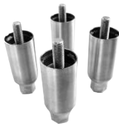
6" and 4" Stainless Steel Legs