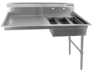
48" Undercounter Dishtable